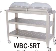
WBC-5RT 5 Pans & 2 Rolltop Lids